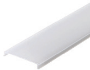
HAYS-LNS-XXX-6.5 XXX = OPL (Opal), CLR , (Clear), DIF (Diffused) lens, length 6.5'