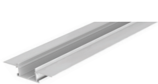
HAYS-CHAN-SLV-6.5 Anodized Aluminum Extrusion, available in 6.5' lengths