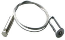
ANZI-SS-CBL Anzio Urban Stainless Steel Suspension Factory standard length 41'